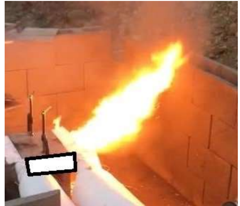
Short Duration Fire Event